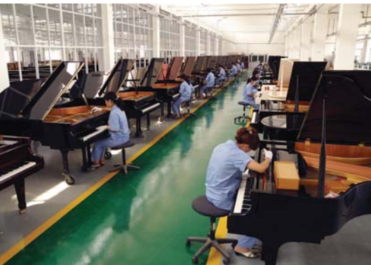
Hundreds of SUZUKI grand piano in the assembly line before final inspection.