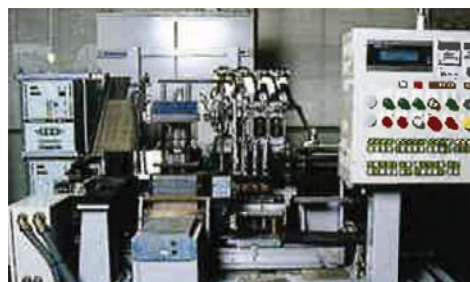
Design and manufacturing process using computer numeric controlled, high precision tools.