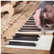
Solid Spruce Key Wood