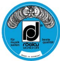
High grade German Roslau strings