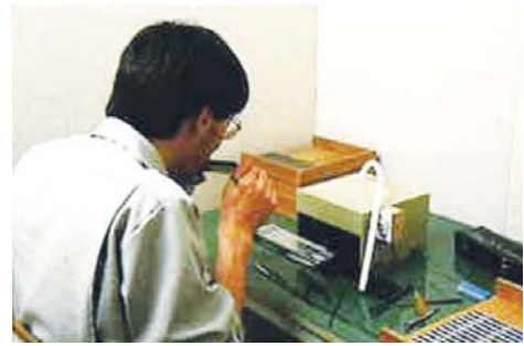
Experts and Specialists team for mechanical, electronic and computer engineering center of SUZUKI in Japan

Advanced German and Japanese piano production technology are the hallmarks of quality with superb tone and the responsive SUZUKI action.