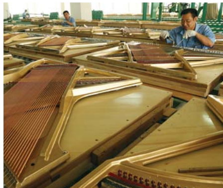
Global production facilities.