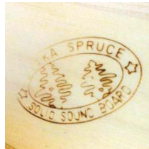
Sitka Spruce Soundboard