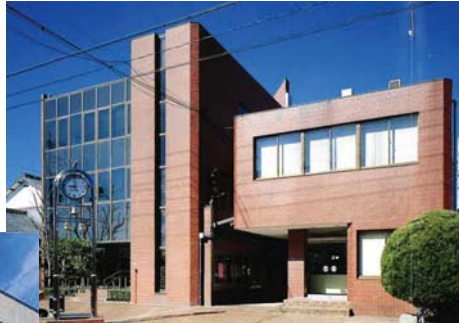
SUZUKI MUSICAL INSTRUMENT MFG. CO., LTD in Hamamatsu, Japan.