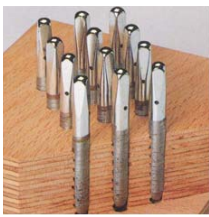
German Dehonit® Pin blocks

SUZUKI piano is individually handcrafted from select materials by artisans with painstaking craftsmanship