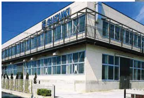
SUZUKI Assembly lines and factories across Japan.