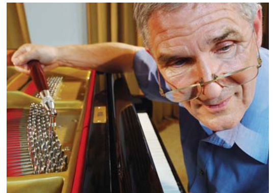
SUZUKI Music Corporation in USA.