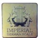
German Imperial Scale